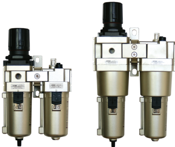
Fully assembled and complete with "T" Type Mounting Bracket.